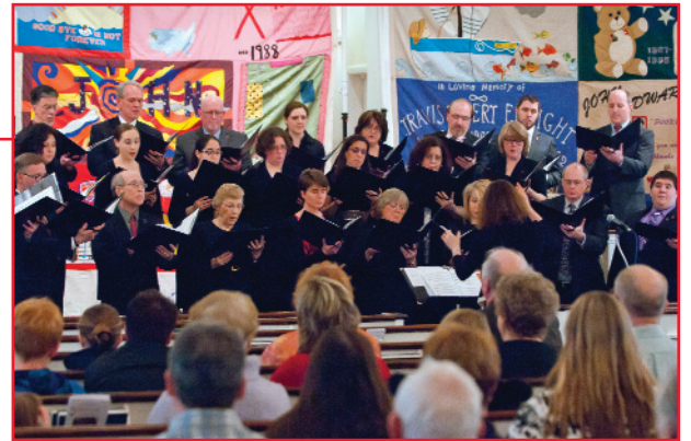
Triad Vocal Ensemble

Saturday, April 22 at 7:00 PM Parsippany United Methodist Church 903 S. Beverwyck Road, Parsippany NJ